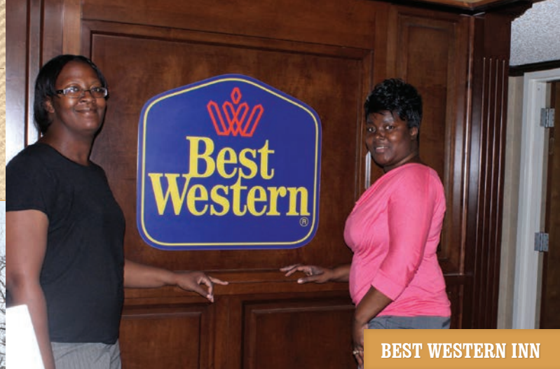
BEST WESTERN INN

The Best Western Inn blends southern hospitality with great value. Amenities include a seasonal pool, on-site business center, and a full complimentary breakfast. Exterior room entrances make the Best Western a popular choice among boaters and motorcyclists.