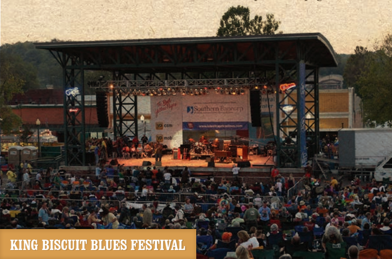
KING BISCUIT BLUES FESTIVAL