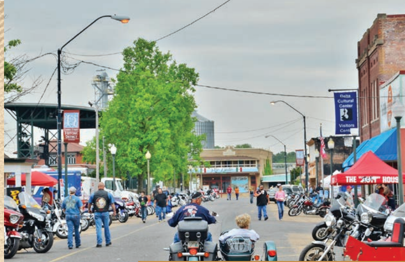
WILD HOG MUSIC AND MOTORCYCLE RALLY