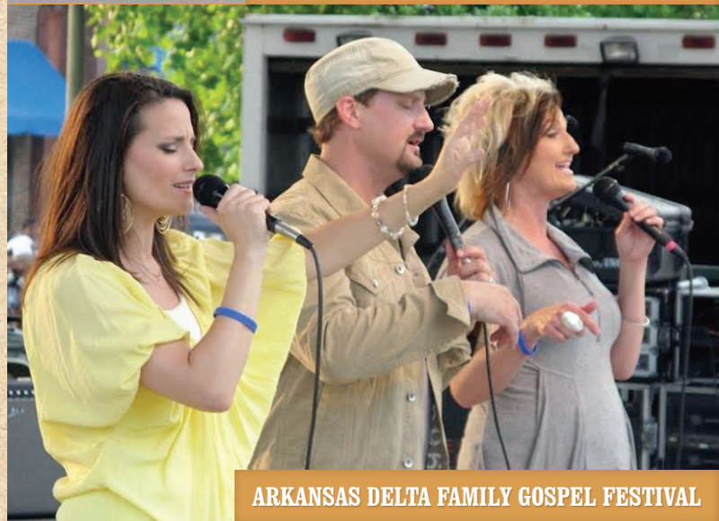
ARKANSAS DELTA FAMILY GOSPEL FESTIVAL