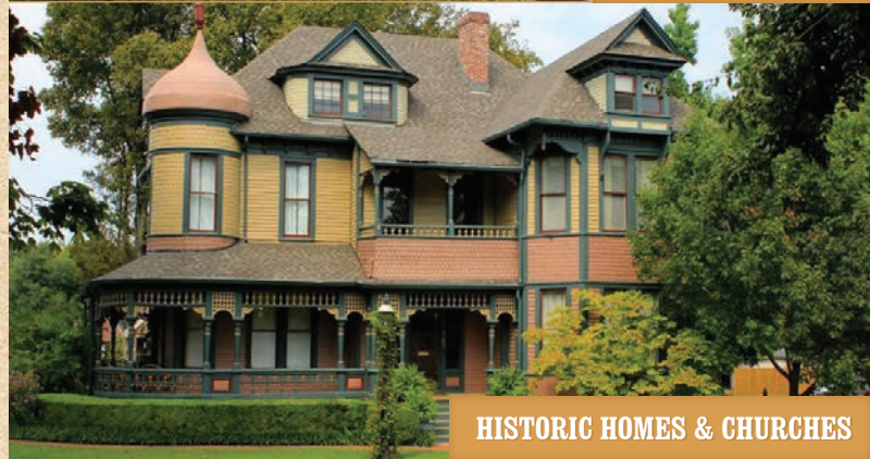
HISTORIC HOMES & CHURCHES