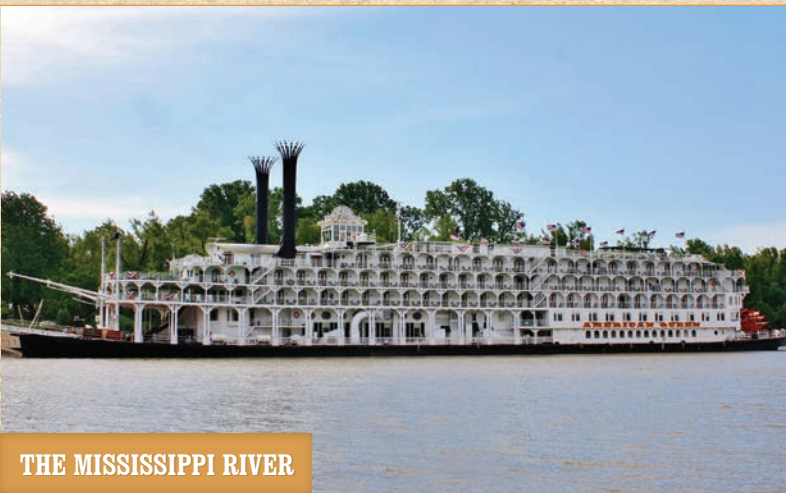
THE MISSISSIPPI RIVER