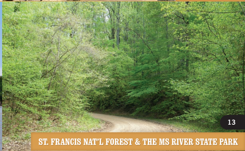
ST. FRANCIS NAT'L FOREST & THE MS RIVER STATE PARK