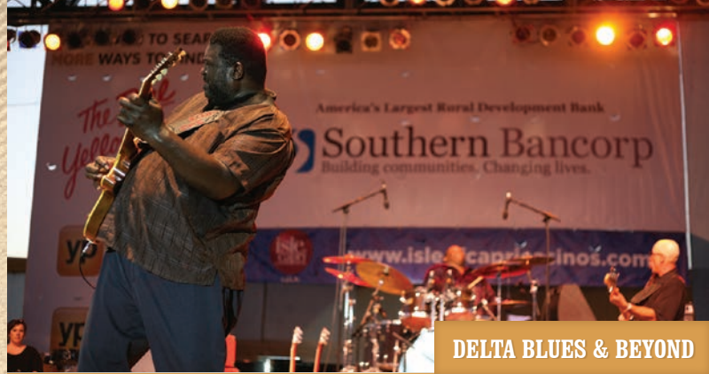
DELTA BLUES & BEYOND