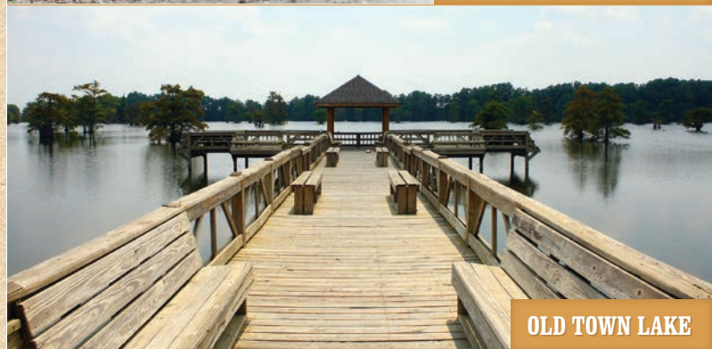
OLD TOWN LAKE