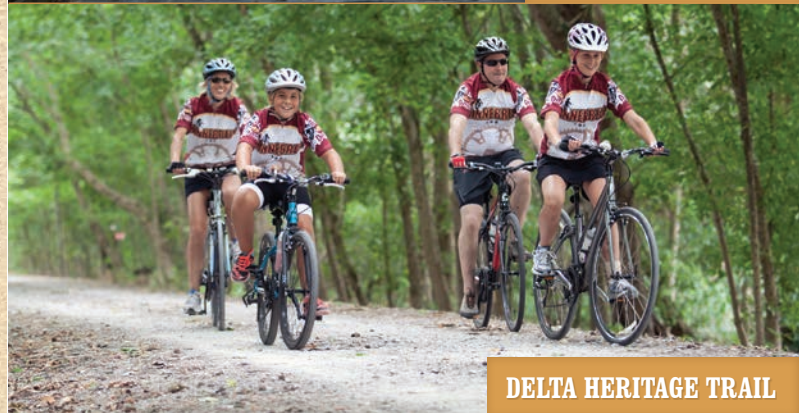
DELTA HERITAGE TRAIL