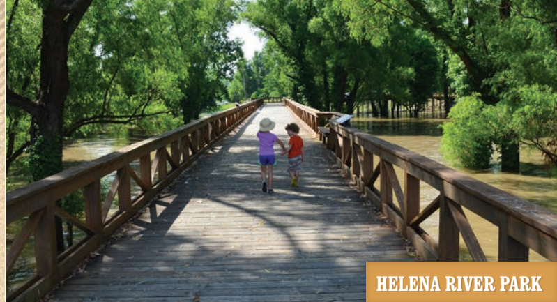
HELENA RIVER PARK