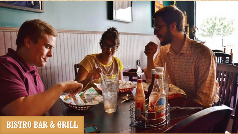
BISTRO BAR & GRILL

From BBQ and burgers to soul food, Helena's food scene is rooted in American culinary staples.