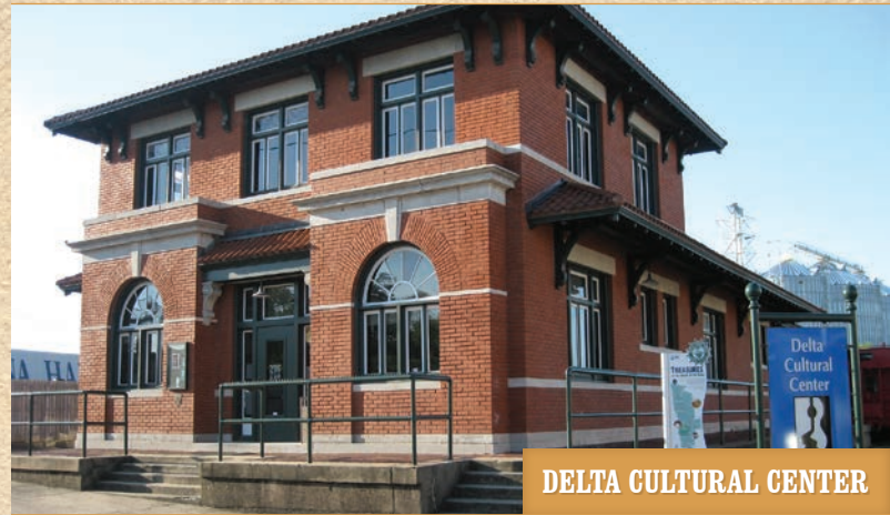
DELTA CULTURAL CENTER