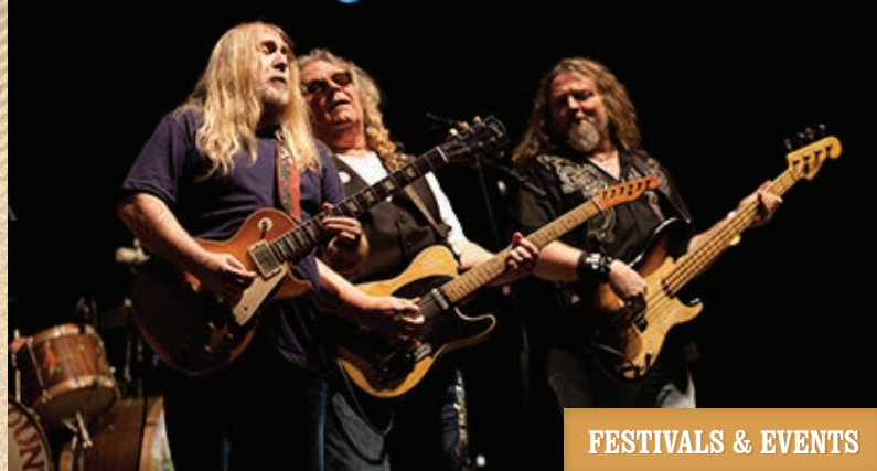
FESTIVALS & EVENTS

Our friends who have the opportunity to spend more than a day in Helena will find our local accommodations are the perfect way to rise and shine. After touring the sights and sounds of Helena, kick back and relax in your choice of settings. Whether you desire a traditional hotel, or want to try out a historic bed and breakfast, Helena accommodates in true Southern style.