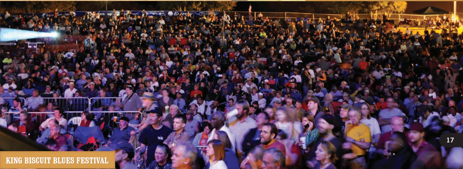
KING BISCUIT BLUES FESTIVAL