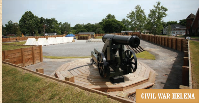
CIVIL WAR HELENA