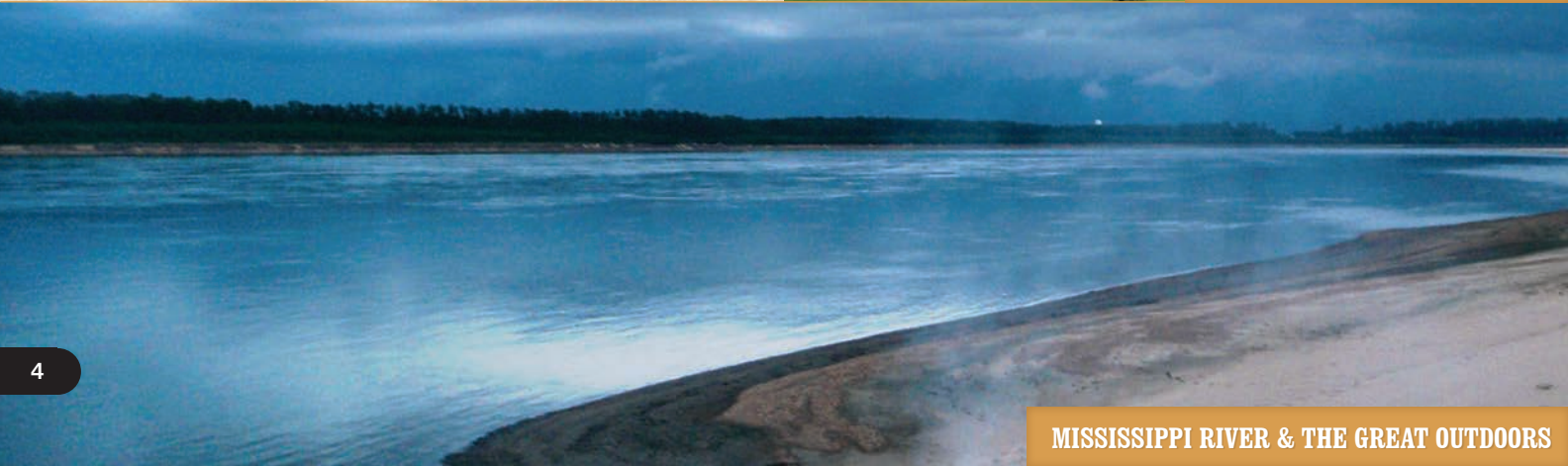
MISSISSIPPI RIVER & THE GREAT OUTDOORS