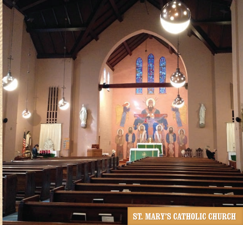
ST. MARY'S CATHOLIC CHURCH