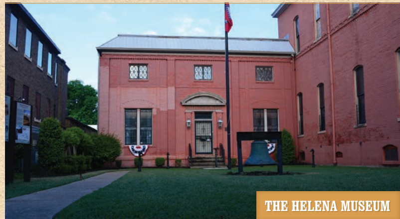
THE HELENA MUSEUM

a museum of the Department of Arkansas Heritage, is dedicated to interpreting the history of the Arkansas Delta. The center is comprised of two museum locations - the Depot and the Visitors Center, with exhibits on the Civil War, the settlement of the Delta region, and a live radio studio where King Biscuit Time is broadcast every weekday at 12:15pm.