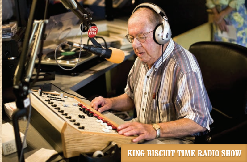
KING BISCUIT TIME RADIO SHOW

about additional festivals & events in Helena, please see page 16