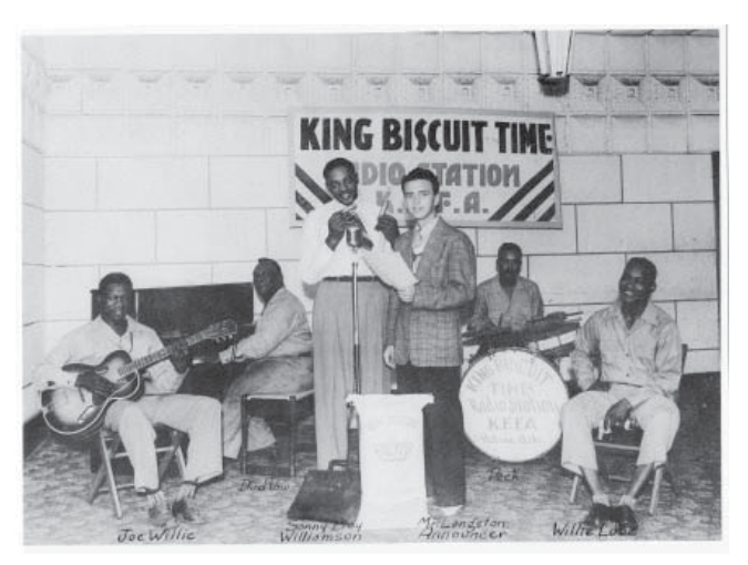
King Biscuit Entertainers ca. 1944 at KFFA's York Street studio.