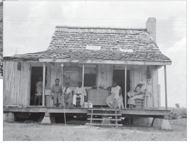
Prepared for Department of Arkansas Heritage Delta Cultural Center Helena, Arkansas

Helena-West Helena Advertising and Promotion Commission Helena, Arkansas