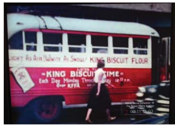
The 1952 King Biscuit Entertainers tour bus.

Develop a Delta Blues Interpretive Center Using the report prepared for American Music Museum, Inc. by Economics Research Associates in 2009 as a baseline study begin looking into the possibility of building a new facility or rehabilitating an existing structure on Cherry, Walnut or elsewhere in the downtown core. The Economics Research Associates report suggests that an interpretive facility is feasible and that there is a base of visitors that would use it. They report that 40,000 people visit the Delta Cultural Center each year; it is reasonable to assume that most if not all would visit another facility in the city with a regional music focus.