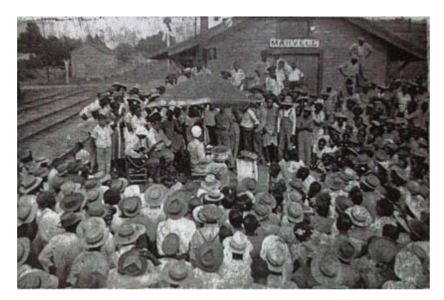
King Biscuit Entertainers in Marvel 1947.

Helena and Phillips County. Initially the tour might be GPS-based tour with accompanying brochure. A cellphone app could also be developed. Eventually, waysides might identify the stores, clubs and other places (or sites of) where the entertainers played (contingent upon landowner permission). An audio component should be integrated into the tour if possible—there will be issues to be resolved concerning rights to the music. The audio component would play no more than about thirty seconds, perhaps a one verse of a