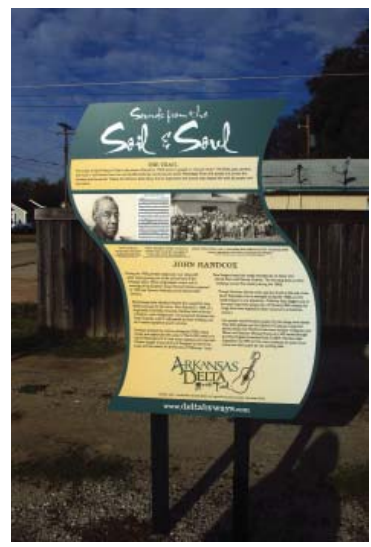
Interpretive marker from 2009 project.

Each wayside panel that features a specific genre of music could have its own look. For instance the blues panels could feature a blue frame or perhaps a panel background color as was done with the Civil War Helena interpretation. On the Union signs the panel background was light blue, the Confederate panels were gray and the civilian panels are tan. Something similar could be done with the musical genres to set them apart.