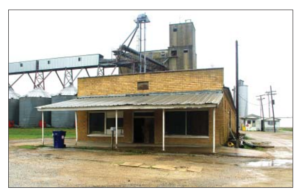
Old Howe Lumber Company store in Wabash. The King Biscuit Entertainers played here in 1952.

September took the men back to Mississippi for five shows in Lambert, Marks, Belen, Jonestown and Lula. The next weekend the tour returned to Arkansas as the band played at stores south of Elaine on Hwy 44 at Deerfield, Ferguson, Crumrod, Lumdell and Mellwood in Phillips and Desha counties. On September 20, they played the Phillips County Fair at Marvell. On September 27, the King Biscuit Entertainers began at Turner in western Phillips County and played at seven stores in that area. The next Saturday they did