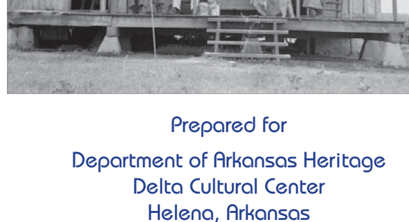
Prepared by Mudpuppy & Waterdog, Inc. Versailles, Kentucky

Helena-West Helena Advertising and Promotion Commission Helena, Arkansas