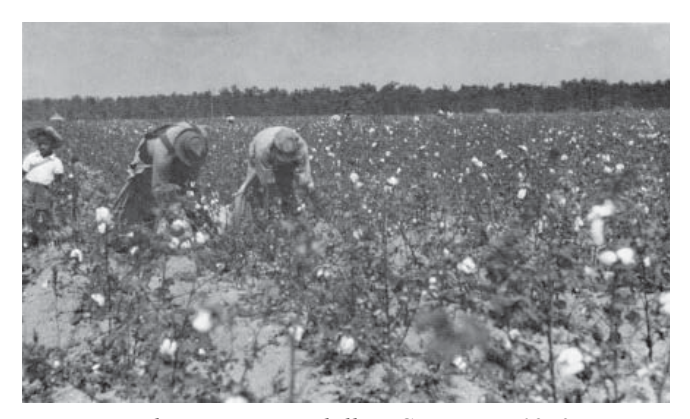
Picking cotton in Phillips County ca. 1940.

segregation laws in the landmark case Plessy v. Ferguson, which allowed codification of the concept "separate but equal."<sup>9</sup>